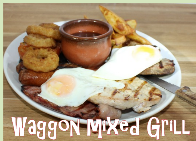
Waggon Mixed Grill